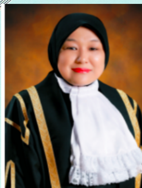
Lead Convenor: Justice Dato' Hajah Aliza Sulaiman Judge of the High Court of Malaya