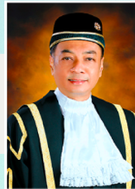
Panel Speaker: Justice Tuan Nadzarin Wok Nordin Judge of the High Court of Malaya