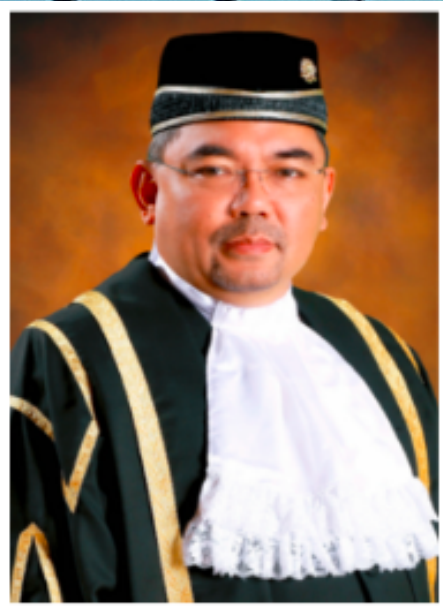
Moderator: Justice Dato' Ahmad Fairuz Zainol Abidin Judge of the High Court of Malaya

"A Home for the Whole Spectrum of Law Professionals"